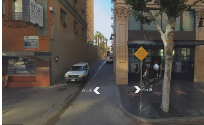
Figure 2 Street view of only vehicle access point

For reference, a copy of the Draft Environmental Impact Report (DEIR) transportation and traffic analysis submitted by experienced traffic engineering professional, Tom Brohard, PE is attached. We agree with his DEIR project traffic analysis and summary that additional study, evaluation, and findings disclosure to the public is required. This analysis must be completed in advance of project approval for the Lead Agency to comply with CEQA's intent to evaluate the project's environmental operational, project, and cumulative impacts.